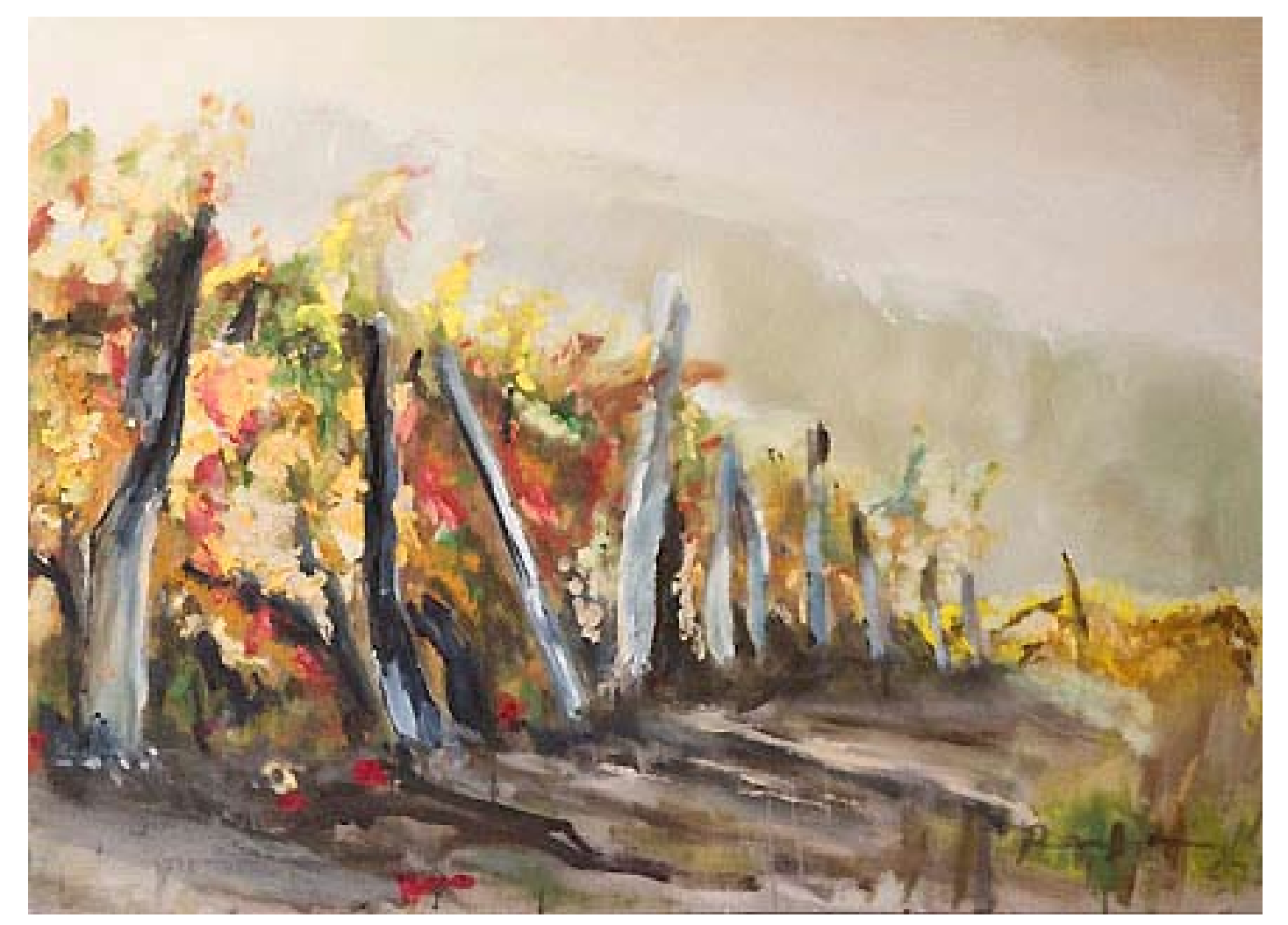
Serralunga d'Alba Giallo | Oil and soil on canvas, 150 x 110 cm, 2007