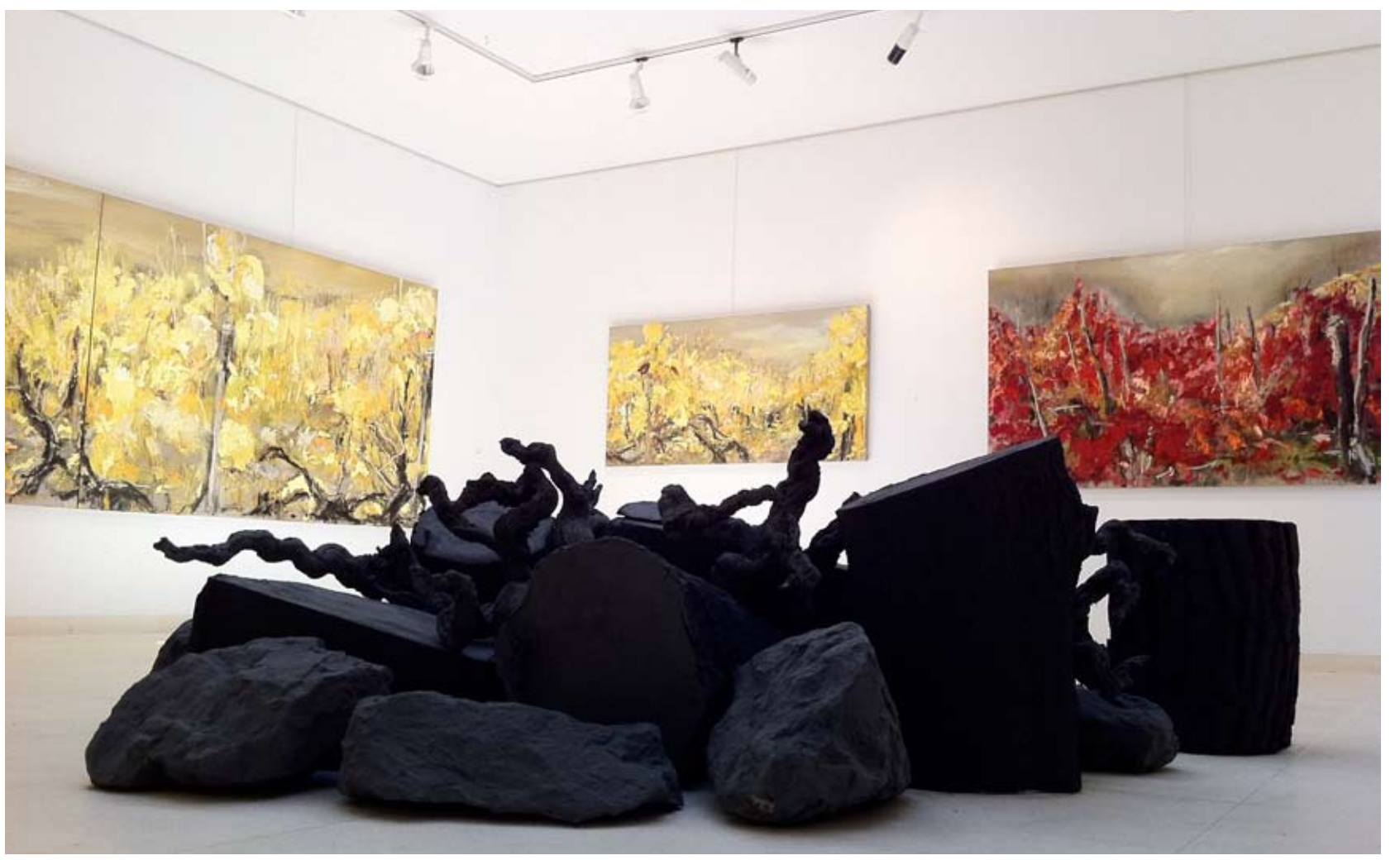
La Nature Morte | Installation Krikhaar Foundation | 900 x 300 x 900 cm, 2010