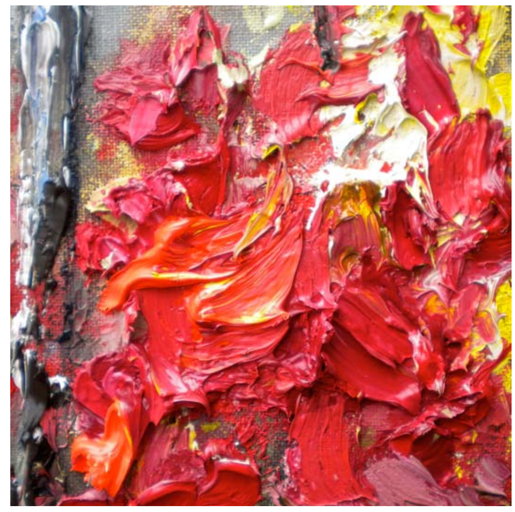
Serralunga d'Alba | Detail