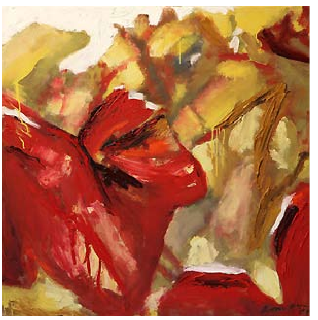
Leaves | Oil and soil on canvas, 120 x 120 cm, 2010