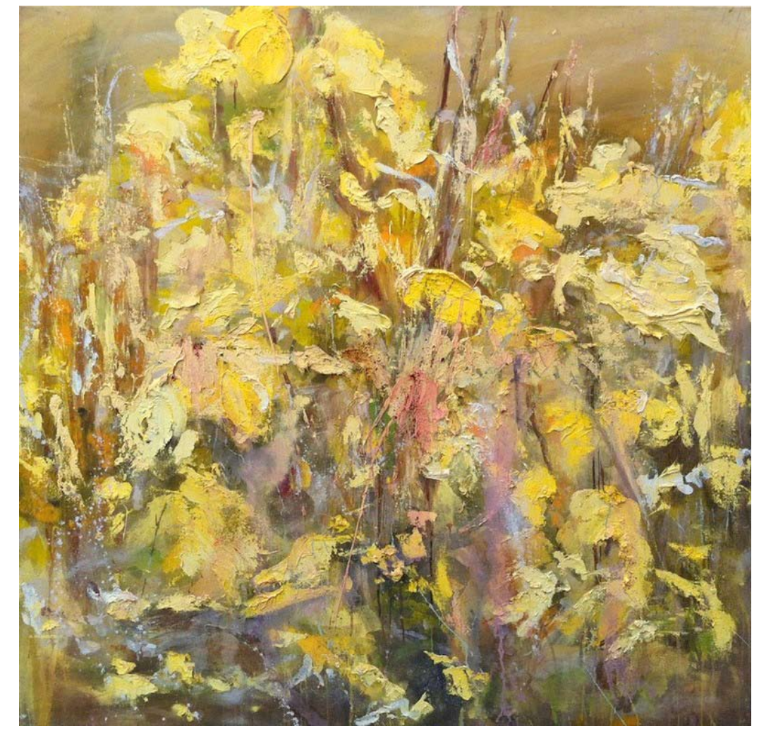
Champagne | Oil and soil on canvas, 140 x 140 cm, 2010