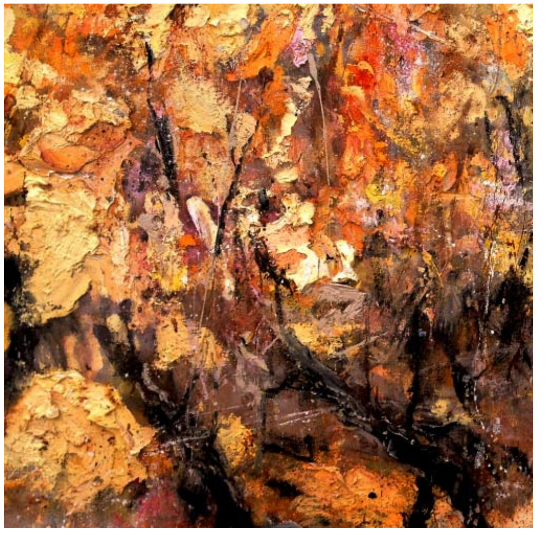
Corton Charlemagne, Bourgogne 2012 | Detail