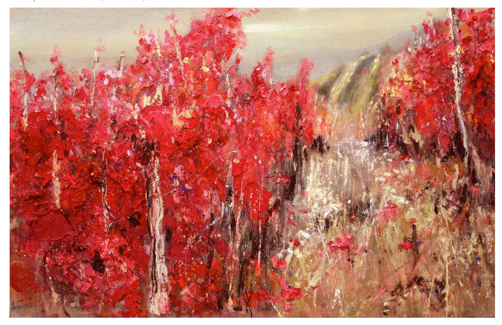
Barolo | Oil and soil on canvas, 160 x 100 cm, 2012