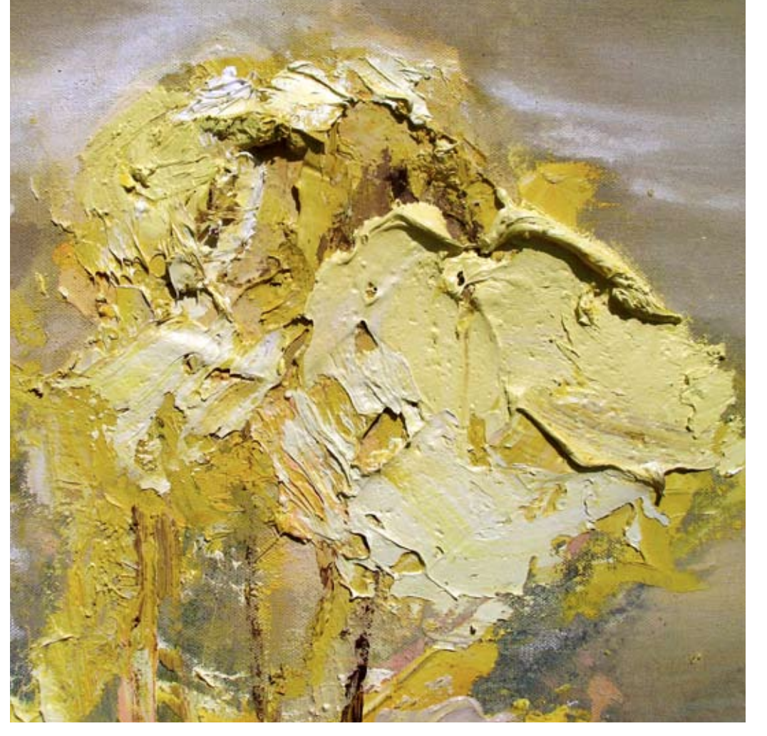
Champagne | Detail