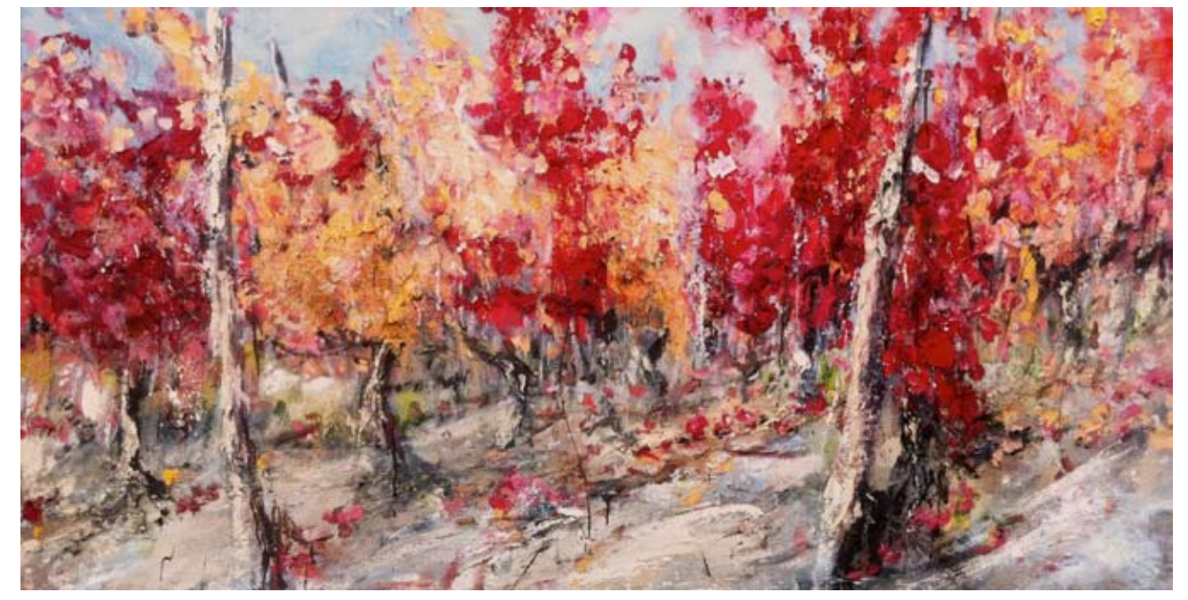
Barolo | Oil and soil on canvas, 200 x 100 cm, 2011