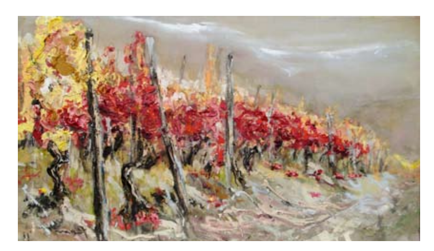
Serralunga d'Alba II | Oil and soil on canvas, 90 x 160 cm, 2009