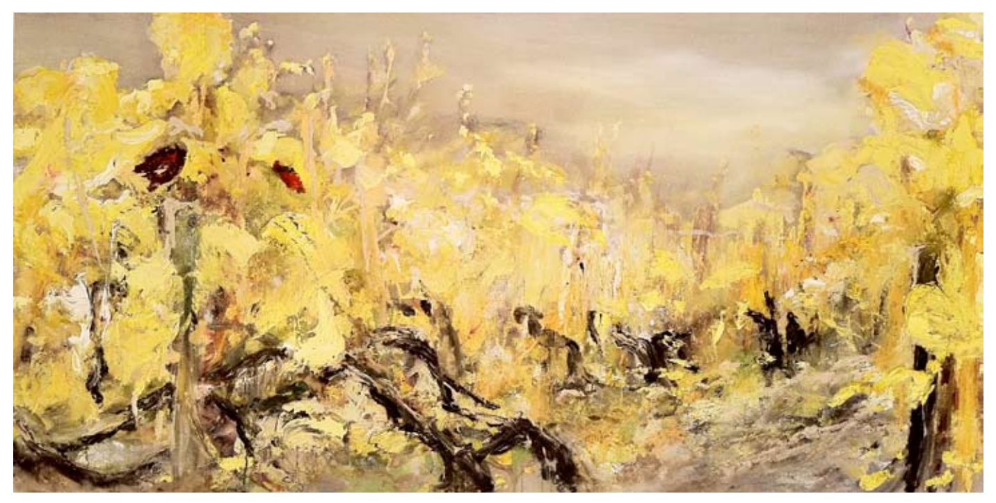
Champagne 2010 | Oil and soil on canvas, 180 x 90 cm, 2010