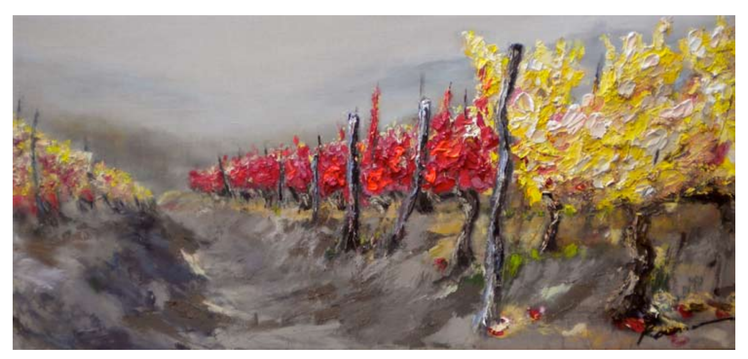
Serralunga d'Alba | Oil and soil on canvas, 200 x 90 cm, 2012