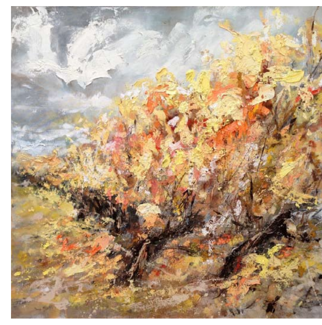
Burgundy 2013 | Oil and soil on canvas, 140 x 140 cm, 2010