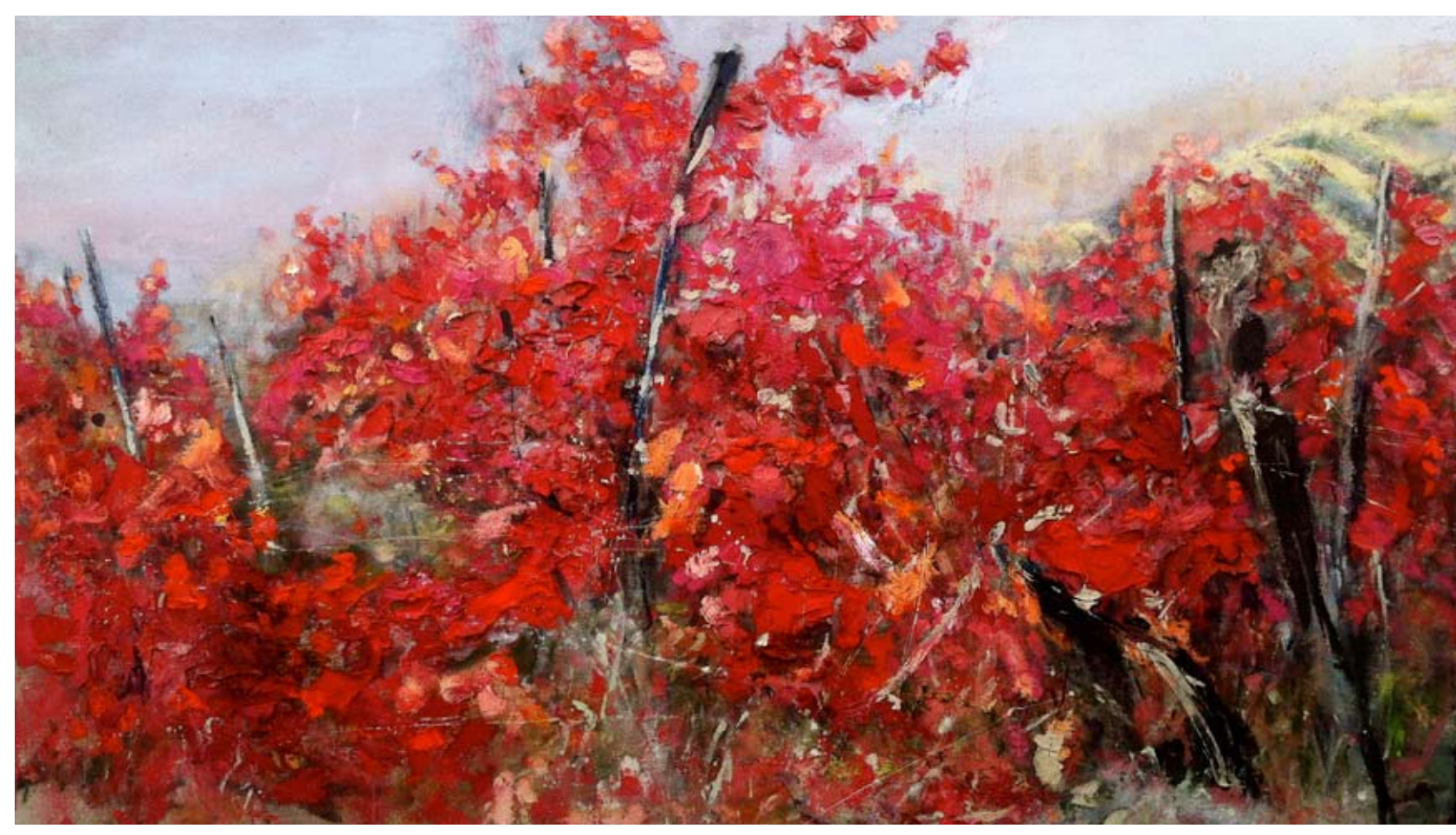
Serralunga d'Alba | Oil and soil on canvas, 180 x 110 cm, 2012