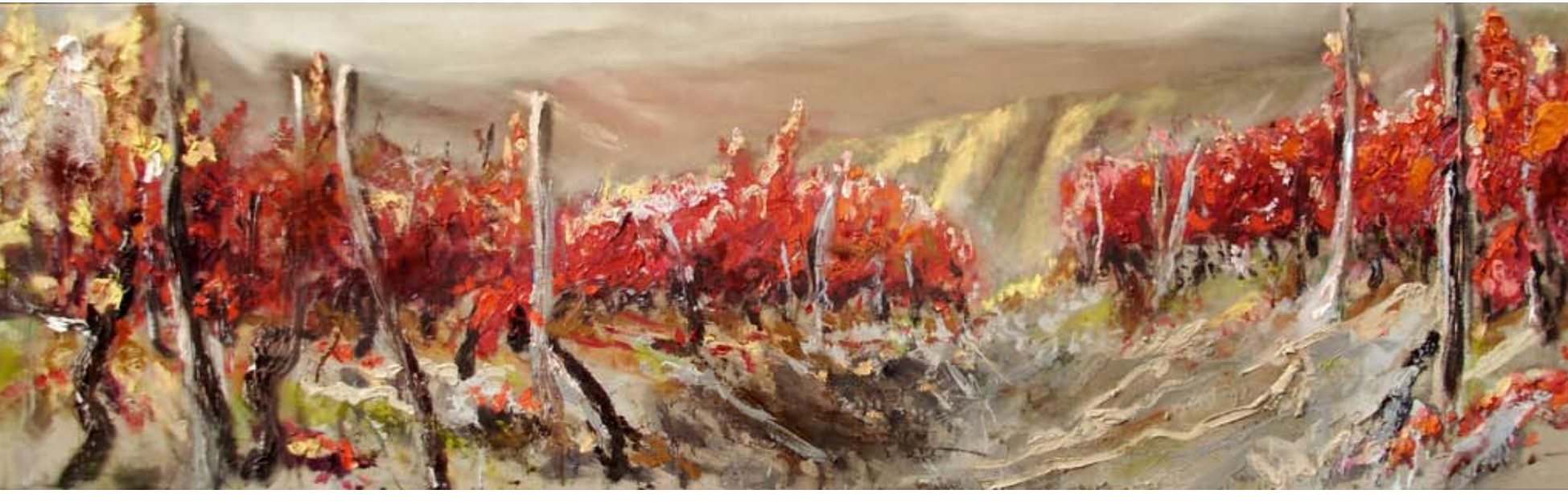
Barolo | Oil and soil on canvas, 250 x 70 cm, 2011

"IT'S ALMOST LIKE MERGING WITH NATURE, EVEN THOUGH THERE'S ALWAYS SOME SENSE OF SHAPING THE IMAGE".