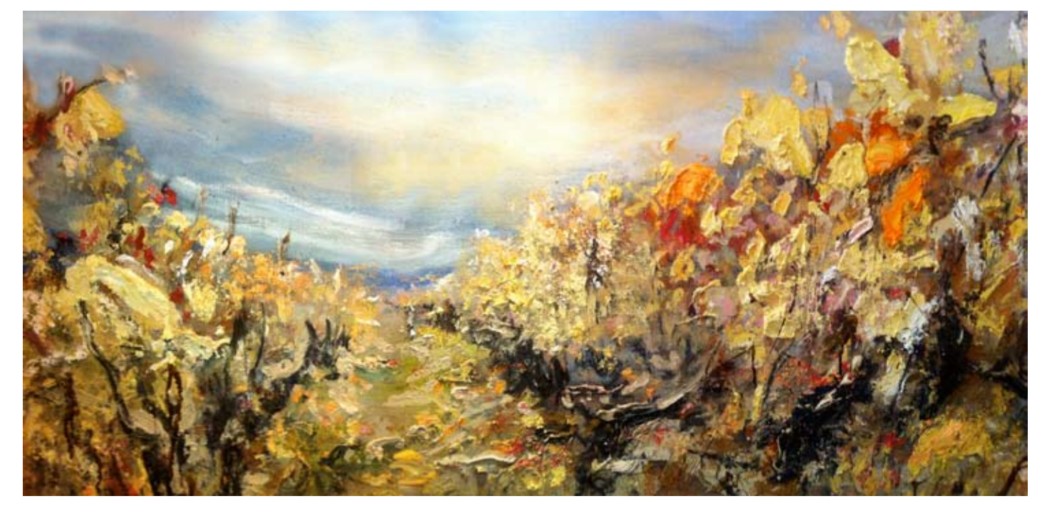
Burgundy 2012 | Oil and soil on canvas, 200 x 80 cm, 2010