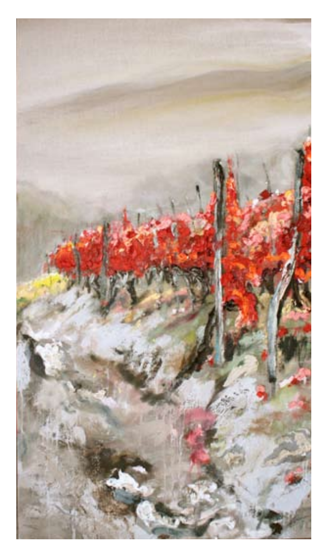
Serralunga d'Alba Rosso | Oil and soil on canvas, 60 x 140 cm, 2007